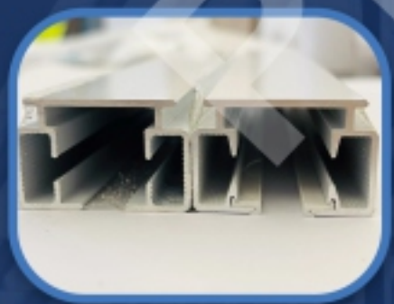
Curtain Rail Profile