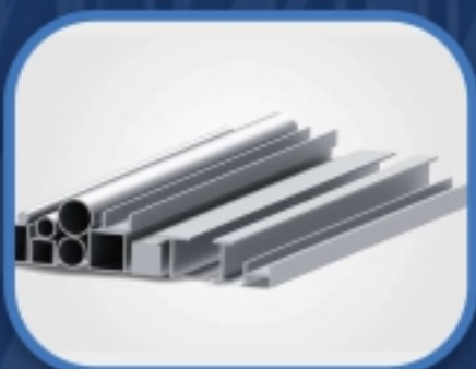
Simple Extrusion Profile